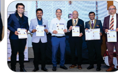
Club Bulletin Release