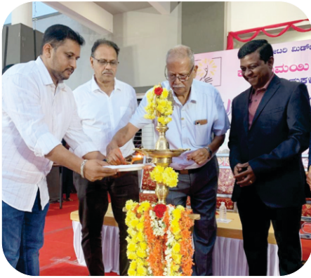
School Day Inauguration @ Manasa Kuteera